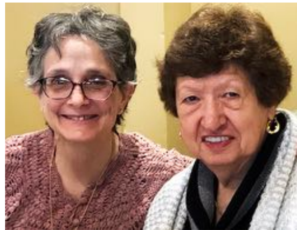
Philotochos Chapters keep the unity of spirit.