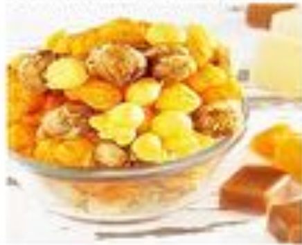
Delicious Popcorn Factory Confusion Popcorn

The youth of St. Demetrios Religious Education will be selling individual bags of Popcorn Factory's delicious Confusion popcorn ('Chicago mix'):