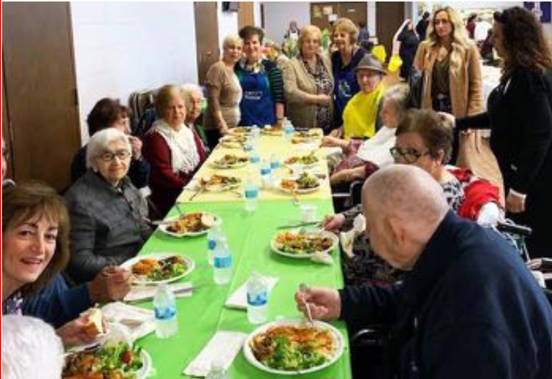
Residents from The Greek American Rehabilitation & Care Centre visited the Bake Sale