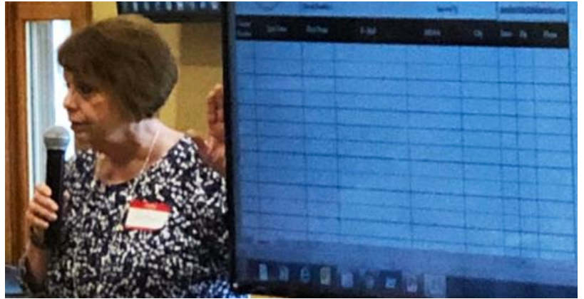
Both Hope and Philoptochos are Powerful.