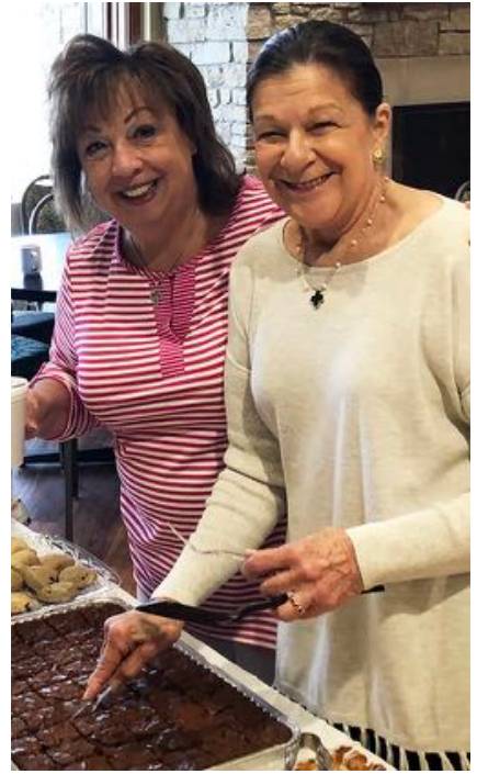
Philoptochos members surround themselves with those that lift them higher.